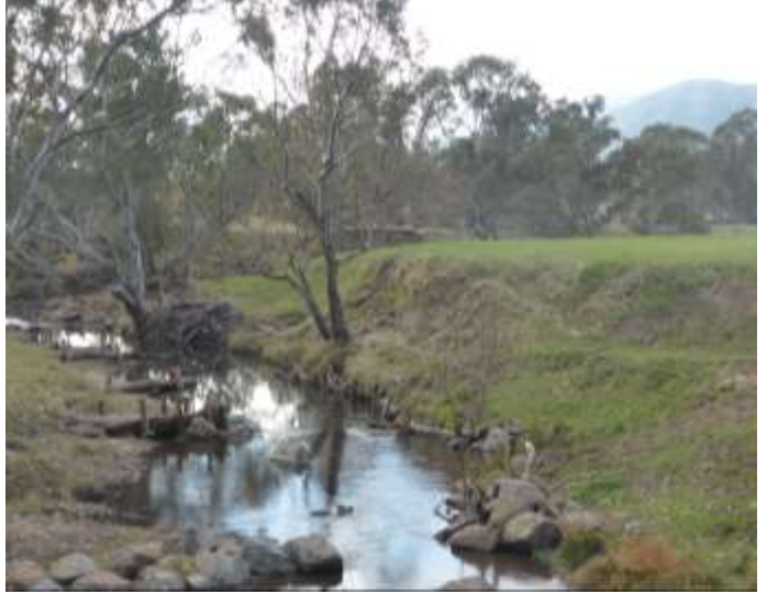
Figure 3. Instream Habitat downstream of Galls Gap Road

Immediately below Galls Gap Road instream habitat improvements works were completed in autumn 2018. This site has also recently been fenced to exclude stock and revegetated. One Macquarie perch was captured using the new structures. Many of the instream structures were out of the main channel due to the extremely low flows at the time of the survey.