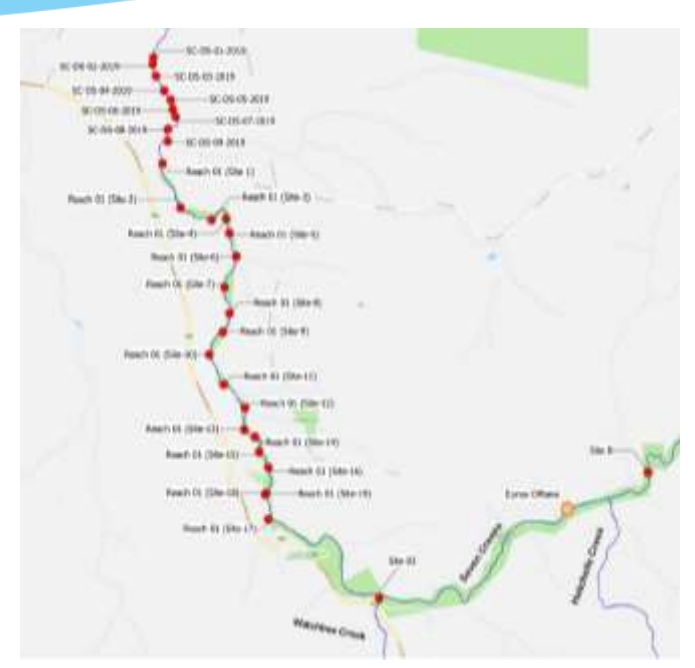
Figure 1. Map of fish survey sites on the Seven Creeks, February/March 2019

All fish species captured were measured and weighed. All fish were released at site of capture (except for carp and redfin). A small fin clip was obtained from 30 Macquarie perch and Trout cod of various sizes for future genetic analysis.